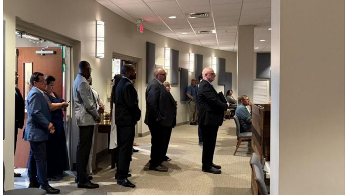
Two of the newly ordained on the district are from Cape Verde.