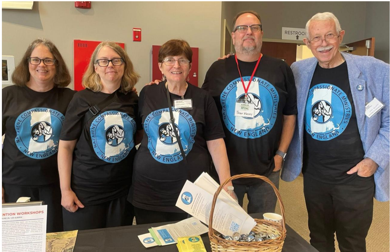
Leaders of a new district initiative named Nazarene Compassionate Ministries New England held a well-attended workshop during NMI Convention and manned a table in the foyer to connect with Assembly Attenders.